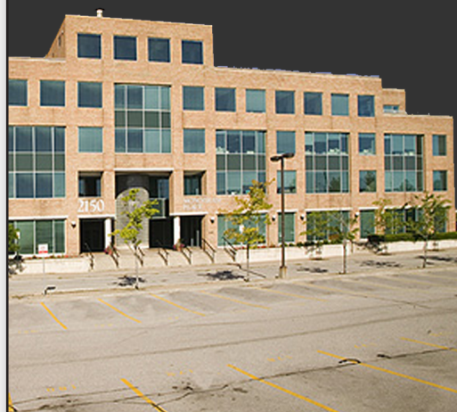
2150 Islington Ave MJCMonogram Properties Inc

Daponte Management Services Ltd. is a privately owned firm that leases and actively manages over five million square feet of prime industrial and commercial real estate located within Canada's fastest-growing business communities. Established in 1993, DaPonte has steadily built a reputation for secure, well-managed properties and high tenant satisfaction rates. The company prides itself on its uncompromising standards, flexibility and dedication to service to provide complete peace of mind for both tenants and owners.